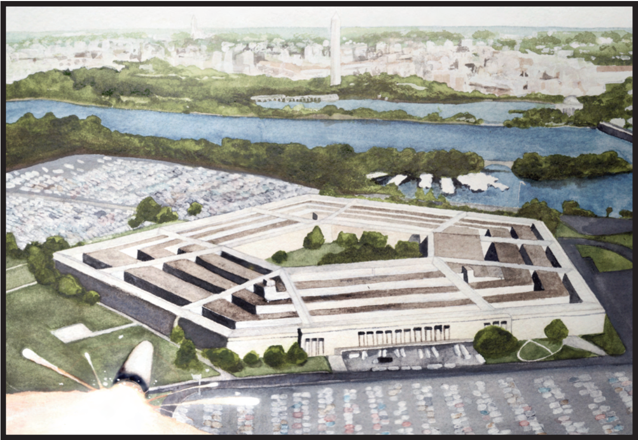
Allison M. Healy

all weekend before to run around the whole building by themselves and thirty-six hours, they say, before, the bomb sniffing Nazi shepherds are pulled off the complex.